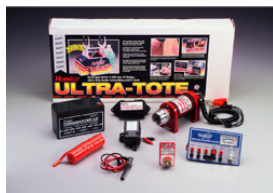
HOBBICO ULTRA-TOTE FIELD BOX COMPLETE COMBO - $130

PORTABLE TOOL CONTAINER, AND TACKLE BOXES WORK GREAT FOR THIS! ITEMS CAN BE FOUND AT ANY STORE THAT SELLS FISHING EQUIPMENT. AVAILABLE IN VARIOUS SIZES AND PRICES.