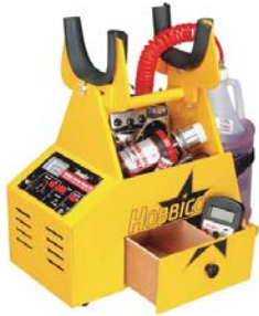
HOBBICO ULTRA-TOTE PREBUILT ARH YELLOW - $40

ALL OF THE FOLLOWING PRODUCTS SHOULD BE FOUND AT YOUR LOCAL HOBBY SHOP.