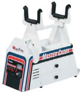
GREAT PLANE MASTER CADY PREBUILT - $45

THIS BOX IS PRE-BUILT AND COMES IN YELLOW, RED, OR BLUE. THIS PRICE IS FOR BOX ONLY.